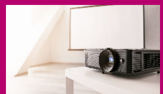
Projector or TV